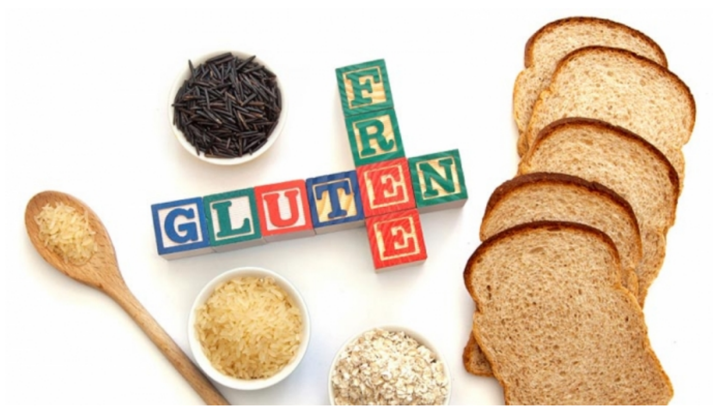
Coeliac disease is a common disorder caused by an adverse reaction to gluten found in wheat, barley and rye