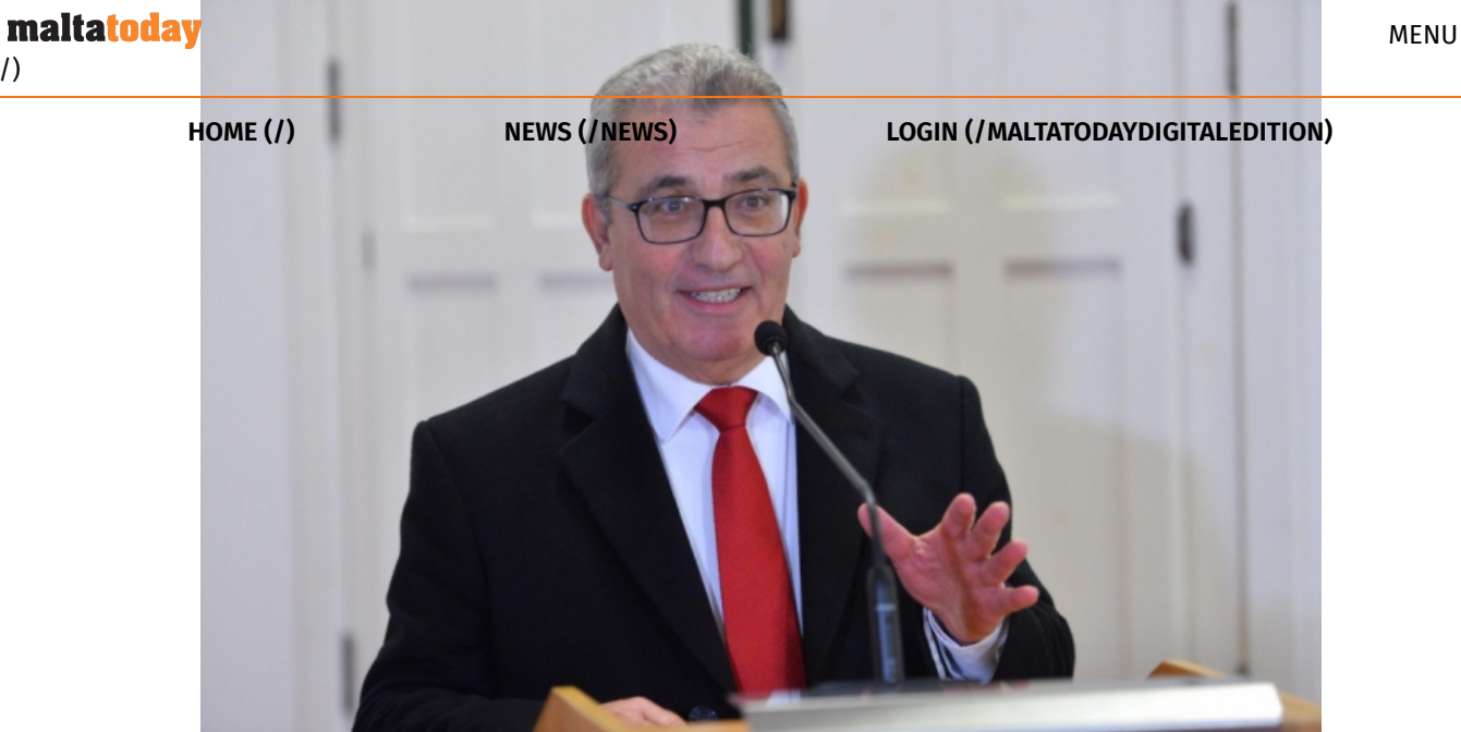
Evarist Bartolo, Minister for Education.

Education Minister Evarist Bartolo, speaking in Italian for the benefit of the Sicilians in the audience, said the project will bring the worlds of education and health together. "It's apt that it does so since our children and our students can only make the most out of their education if they are in good health. Most children can't benefit from a good education due to health issues."